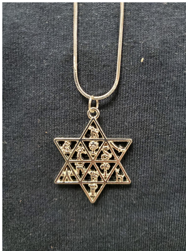
The 12 Tribes of Israel necklace

This necklace has a small symbols representing each of the twelve tribes of Israel.