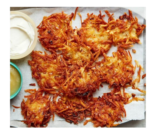
Above: Latkes (Potato pancakes).