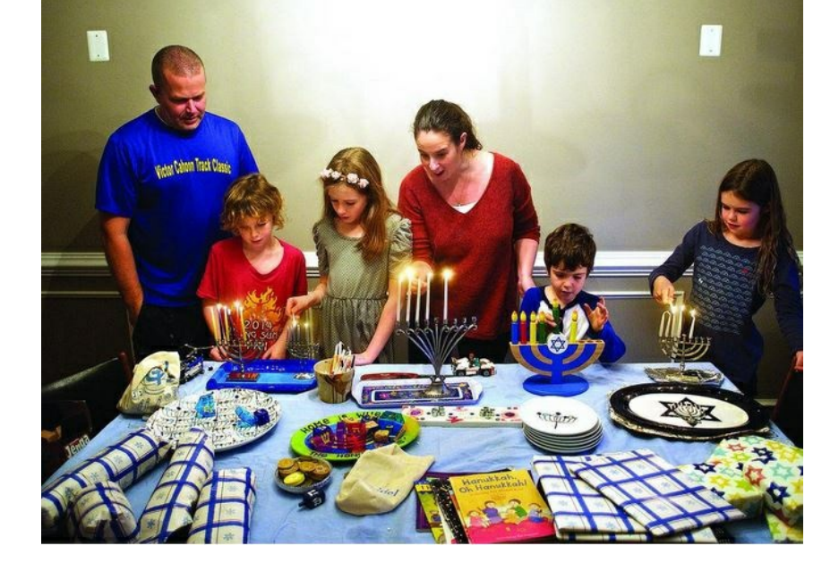
Families lighting the Hanukkah menorah is very popular in Jewish homes.

Traditional Hanukkah food is usually fried in oil. One of the most popular dishes are potato latkes (fried potato pancakes) customarily served with various sauces (e.g. applesauce, sour cream, ketchup). Also popular in Israel is 'sufganiot,' or deep-fried doughnuts. I know – healthy, right?