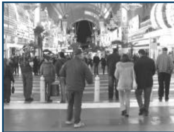
Downtown Las Vegas

Then too, in Las Vegas, over New Year's Eve, we had a team of 7 passing out tracts all week long. We passed out 16,000 tracts to the myriads of people traveling from casino to casino. But I also made a special banner for that city too. It read, "The only sure thing in Vegas, Jesus forgives. But you must ask Him." I held it up loud and proud. Proud to proclaim the righteous name of Jesus in world famous 'sin city.' I also put a star of David in the center of it. Two Jewish young men stopped to talk (one was from