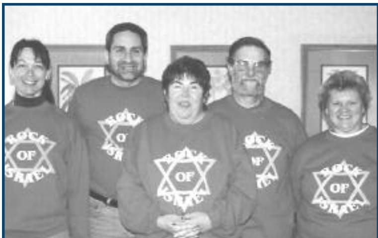
Tall Stacks Cincinnati Team

Present the Messiah to the Jewish people! Learn about Jewish culture! Pass out thousands of tracts! Be a part of a vibrant evangelistic team! Strengthen your faith! We will train you!