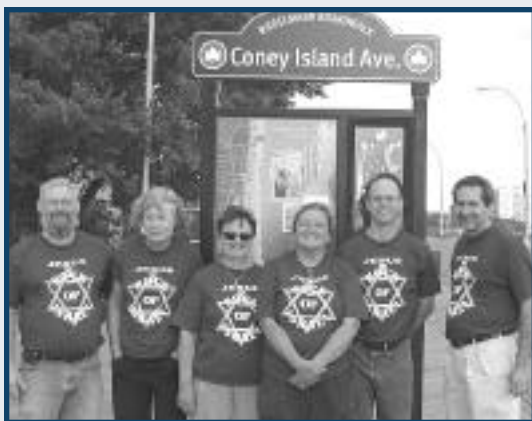
Long Island Team