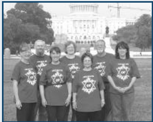
Washington D.C. Team

We handed out 25,000 gospel tracts, had almost 200 conversations, gave out the Gospel of John and gave out evangelistic CD's and tapes in Washington, DC. Three people (that we know) gave their heart to the Lord right there on the street. Praise the Lord.