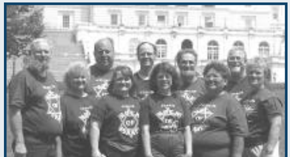
Washington DC Team