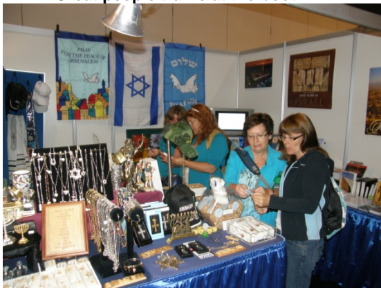
Mezzuzot & Jewelry brought “customers”