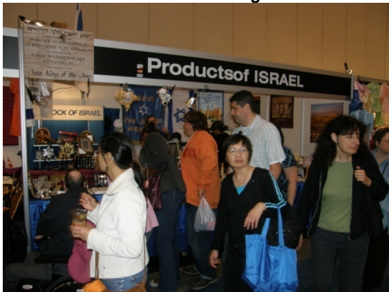
Great people traffic at the booth