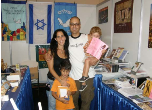
Jewish Family, they took a Tanakh and a Messianic Prophecy book