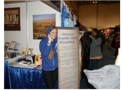
Girl who wanted her photo with our Banner "Jesus made me Kosher."