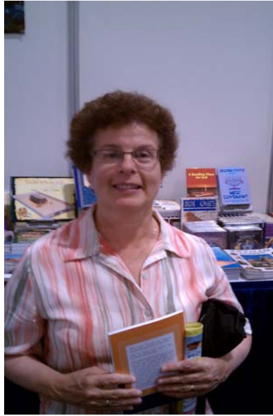
Jewish woman who received book about Jesus the Jewish Messiah

We were able to challenge many to read their Bibles (we gave out a few Tanakhs) and we told them to ask God to reveal the truth. God says "he who seeks Me, will find Me." Though I don't think we had anyone who prayed on the spot to receive Jesus as Messiah, there was a greater openness than I have ever seen. Surely God is drawing His people, and the seeds we planted will bring fruit someday soon.