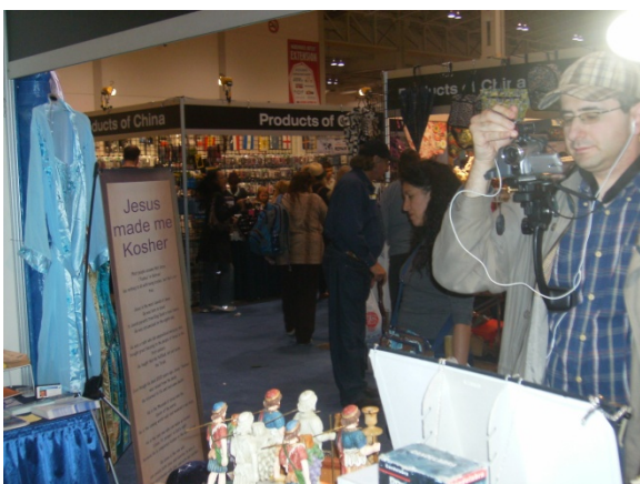
Rabbi's cohort filming the discussion