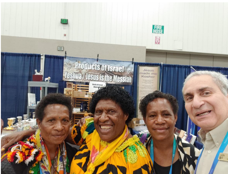
Christians from Papua New Guinea loved our booth.