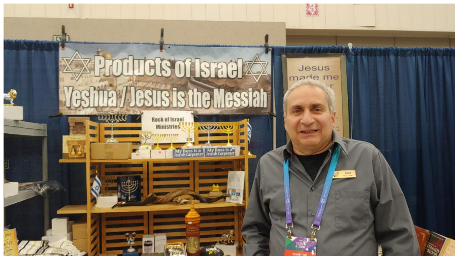
Our booth at Nazarene General Assembly

We trust that the items they took back to their countries will enrich the churches there and help them love the God of Israel and the Messiah of Israel even more.