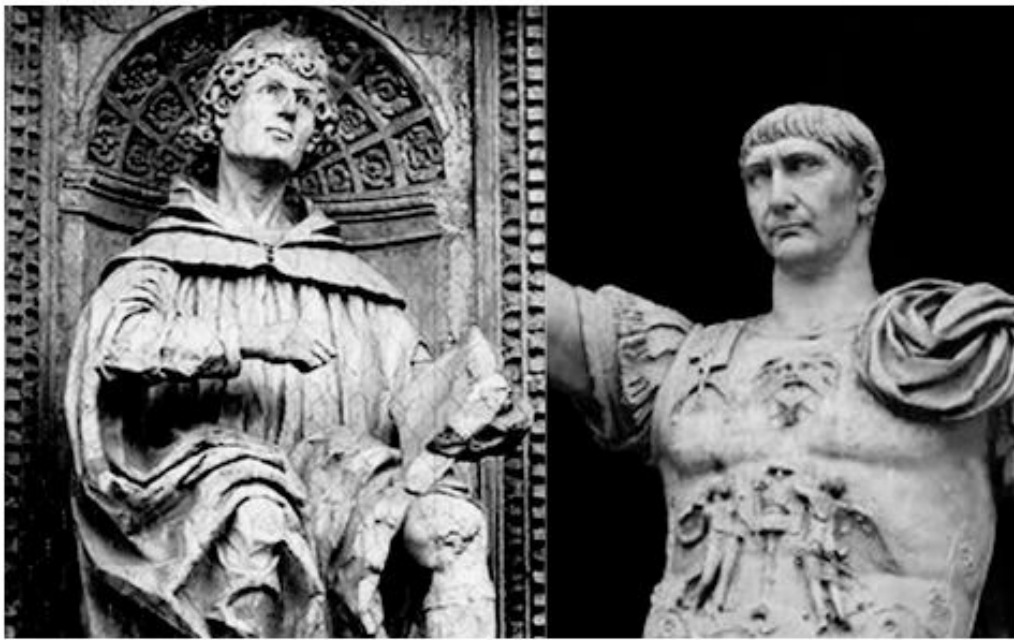
Pliny the Younger—Statue on the Duomo in Como Emperor Trajan—Reigned 98 to 117 AD

Many times, critics of the Bible will say things like, “Jesus never existed.” Well, even the most liberal scholars generally agree that Jesus existed. However, there is even more historical evidence that there were already a large number of followers of Jesus throughout the Roman Empire a mere 70 to 80 years after the crucifixion.