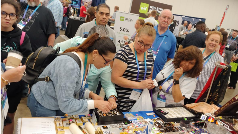
Our booth was non-stop busy