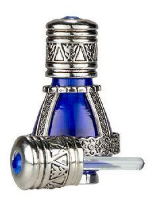
Tiny Anointing Oil Flask

This unique bottle of anointing oil is one of a kind. It only stands about 2 two inches tall (about two-quarters high), but is very elegant and ornate. Comes pre-filled with oil.