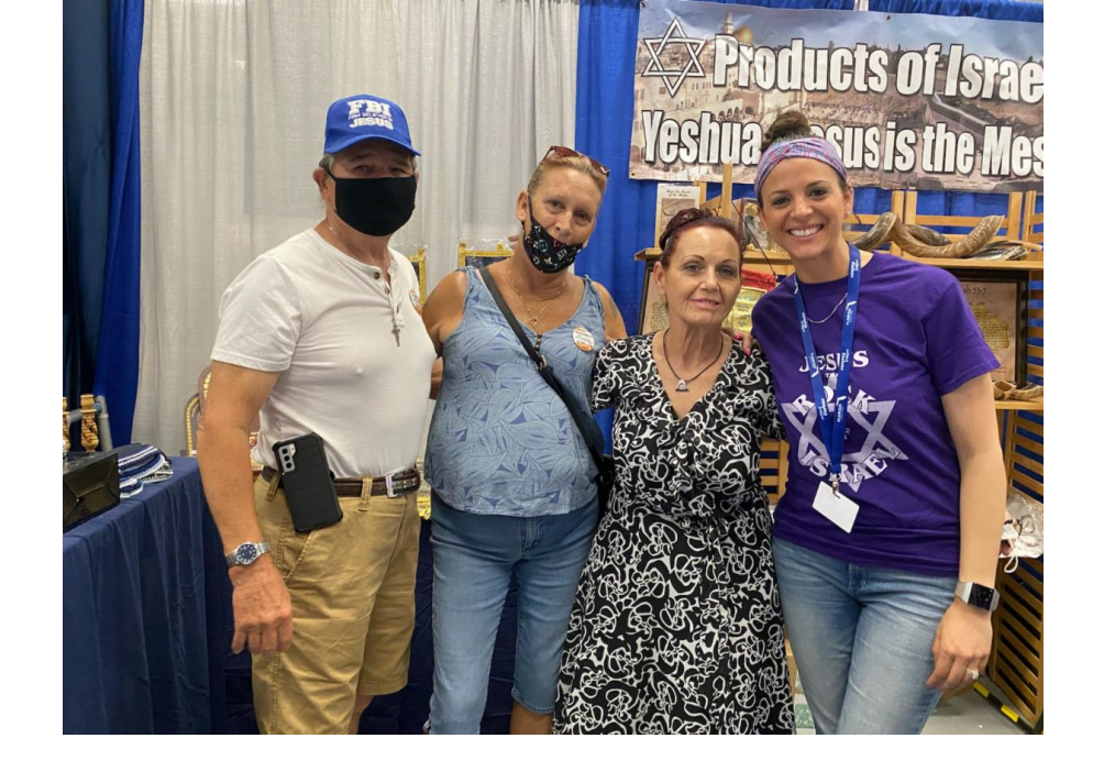
A few moments later