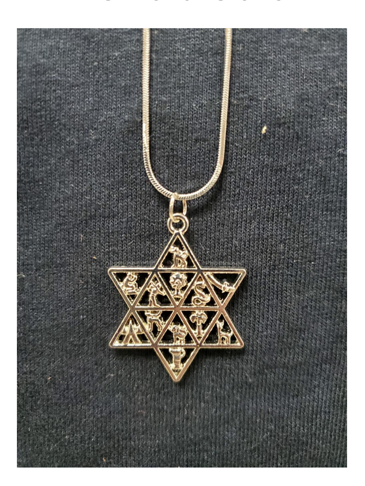
The 12Tribes of Israel necklace

This necklace has a small symbols representing each of the twelve tribes of Israel.